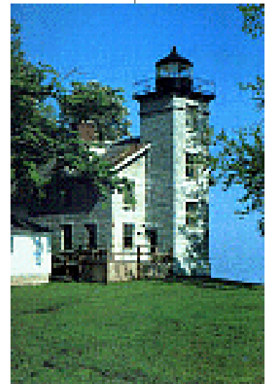
Sodus Bay Lighthouse

The end of the show was a conglomeration of many places to show that lighthouses were not his only interest. We saw round barns, iron and covered bridges, Japanese pagoda-